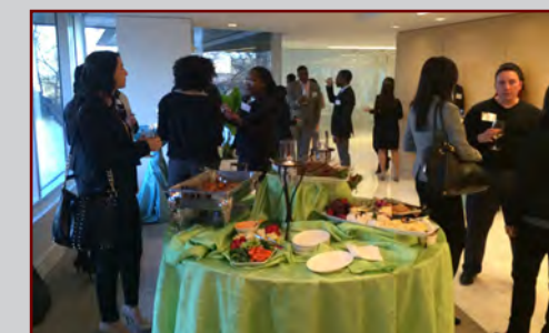
Katten attorneys socialize with first-year law students at LCLD mentoring program events.