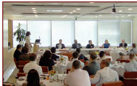
Diverse Katten partners share their keys to success.